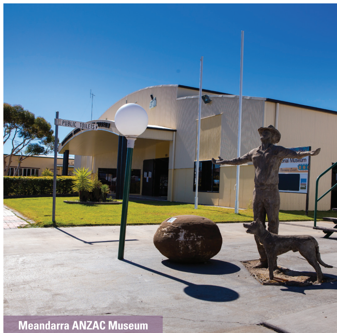
Meandarra ANZAC Museum