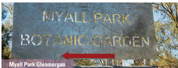
Myall Park Glenmorgan