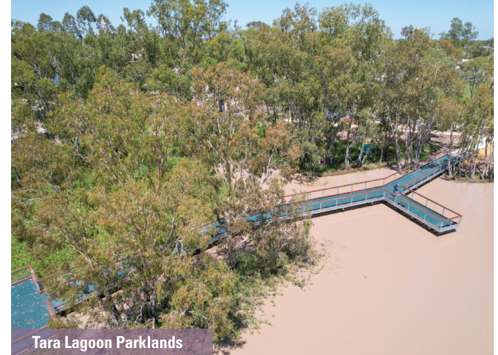
Tara Lagoon Parklands