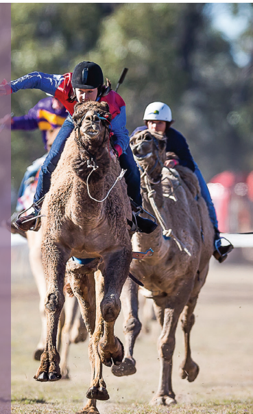
Tara Camel Races

The town was named after the Tara pastoral station that was established in 1852. The township began as a reserve in 1909 when town allotments were sold, and a provisional school opened in 1911. The railway line was extended from Dalby to Tara in 1911.