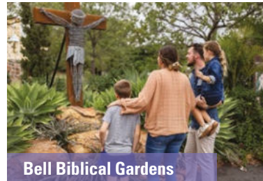
Bell Biblical Gardens