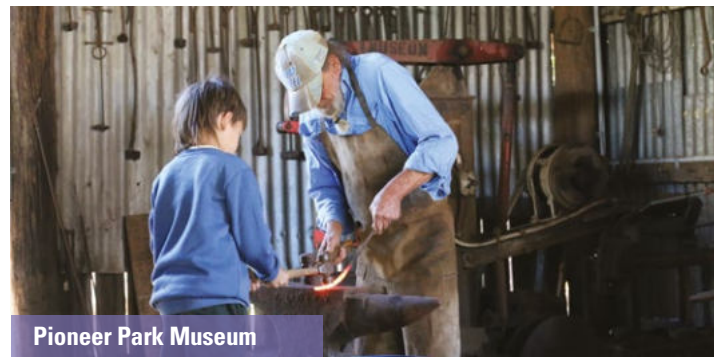
Pioneer Park Museum