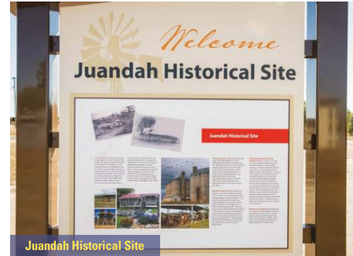
Juandah Historical Site