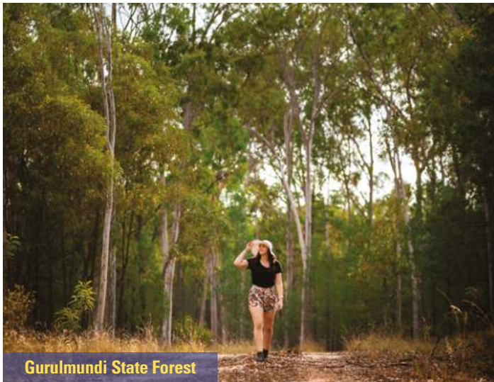
Gurulmundi State Forest