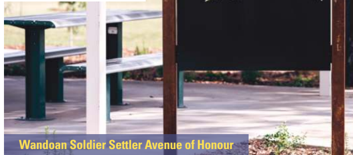
Wandoan Soldier Settler Avenue of Honour