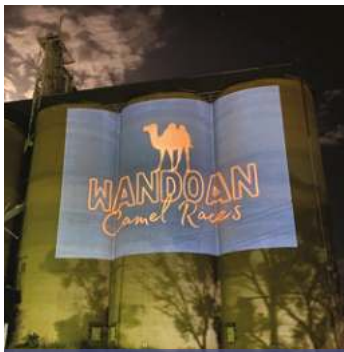
Wandoan Illuminated Silos