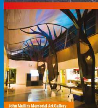
John Mullins Memorial Art Gallery