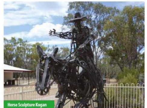
Horse Sculpture Kogan