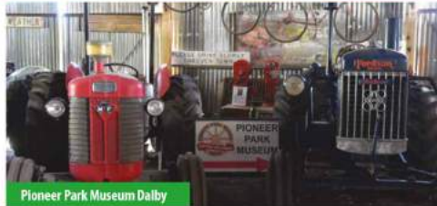
Pioneer Park Museum Dalby