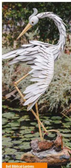
Bell Biblical Gardens