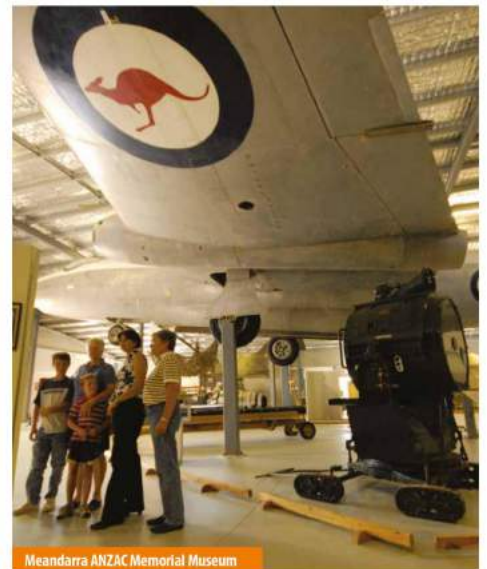
Meandarra ANZAC Memorial Museum