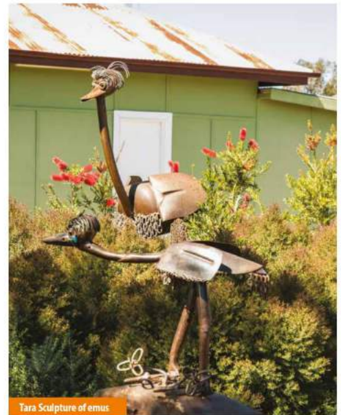
Tara Sculpture of emus

Opening Hours Monday to Friday 9am - 5pm Saturday 9am - 2pm Closed Sunday and Public Holidays