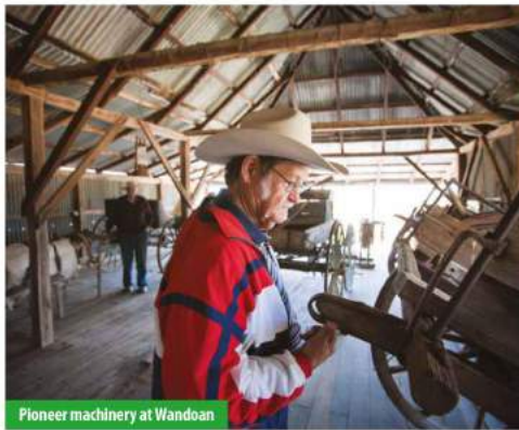
Pioneer machinery at Wandoan