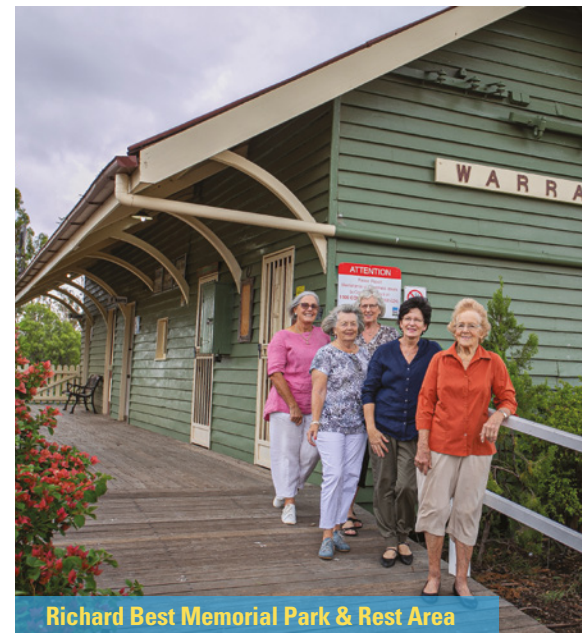
Richard Best Memorial Park & Rest Area