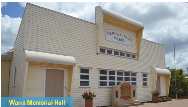
Warra Memorial Hall