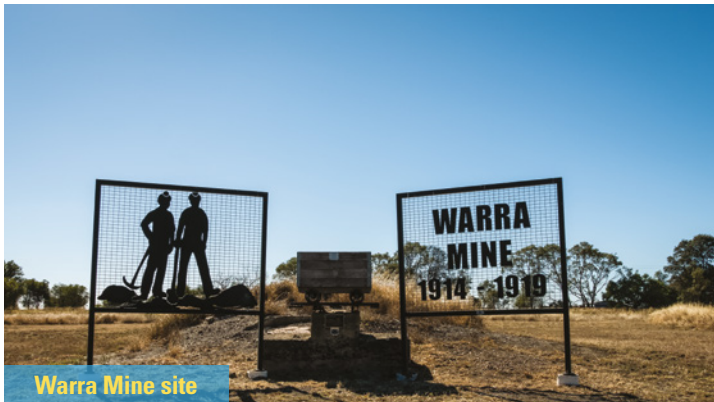
Warra Mine site

Situated just 47 kilometres north west of Dalby on the Warrego Highway. Warra was originally known as Warra Warra named after the