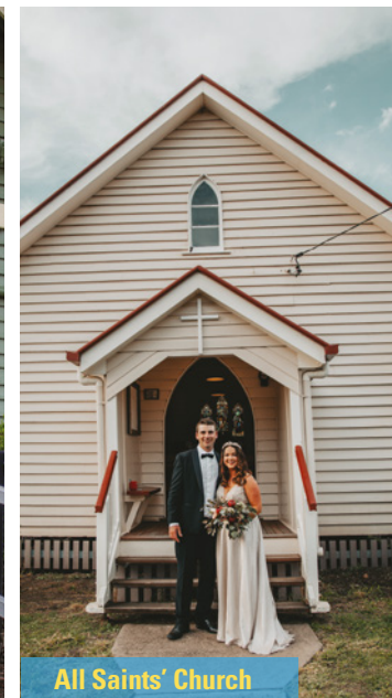
All Saints' Church