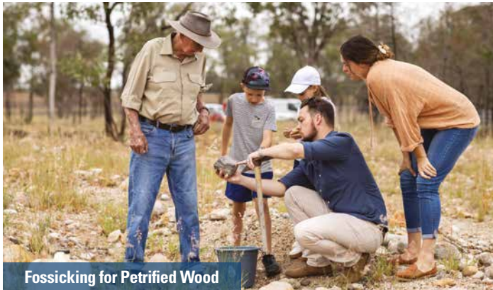
Fossicking for Petrified Wood

Get off the highway and drive along the many sealed roads around Chinchilla that form a grid-pattern amongst flat farming areas, or wind your way around the district's undulating terrain. Drive past fields lush with crop varieties, look for paddocks of grazing cattle or marvel at the infrastructure of the resource industry in the region.