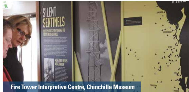
Fire Tower Interpretive Centre, Chinchilla Museum