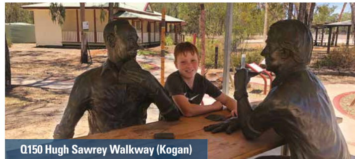
Q150 Hugh Sawrey Walkway (Kogan)