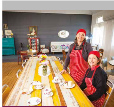
Pips n Cherries Cafe