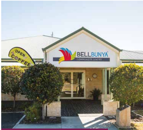
Bell Bunya Community Centre