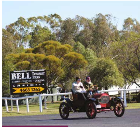
Bell Tourist Park