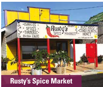
Rusty's Spice Market