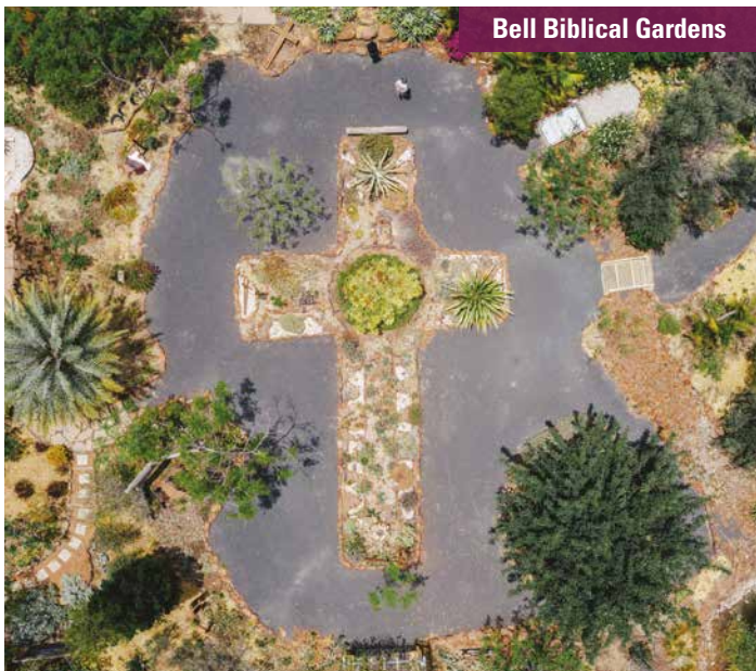
Bell Biblical Gardens