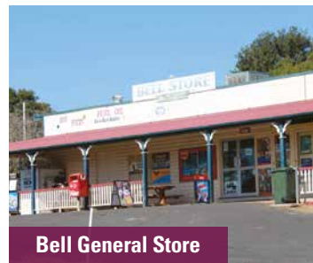
Bell General Store