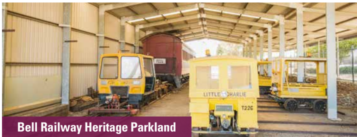
Bell Railway Heritage Parkland