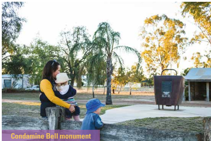
Condamine Bell monument

Why not venture off the main highways to immerse yourself in the true heart of the Western Downs.