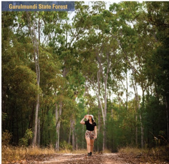
Gurulmundi State Forest