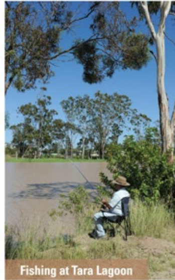
Fishing at Tara Lagoon