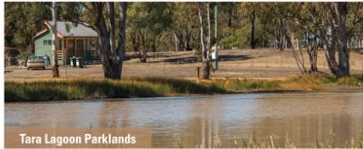
Tara Lagoon Parklands