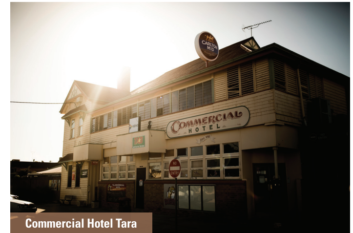
Commercial Hotel Tara