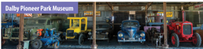
Dalby Pioneer Park Museum