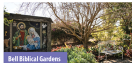
Bell Biblical Gardens