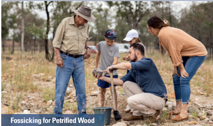
Fossicking for Petrified Wood

Get off the highway and drive along the many sealed roads around Chinchilla that form a grid-pattern amongst flat farming areas, or wind your way around the district's undulating terrain. Drive past fields lush with crop varieties, look for paddocks of grazing cattle or marvel at the infrastructure of the resource industry in the region.