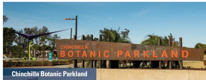
Chinchilla Botanic Parkland