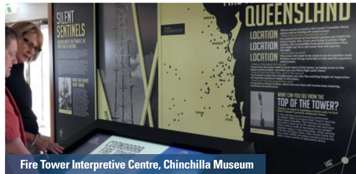
Fire Tower Interpretive Centre, Chinchilla Museum