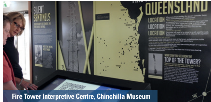
Fire Tower Interpretive Centre, Chinchilla Museum