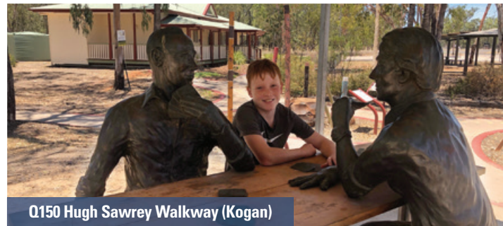
Q150 Hugh Sawrey Walkway (Kogan)